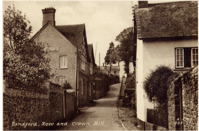
Sandford, Rose and Crown Hill