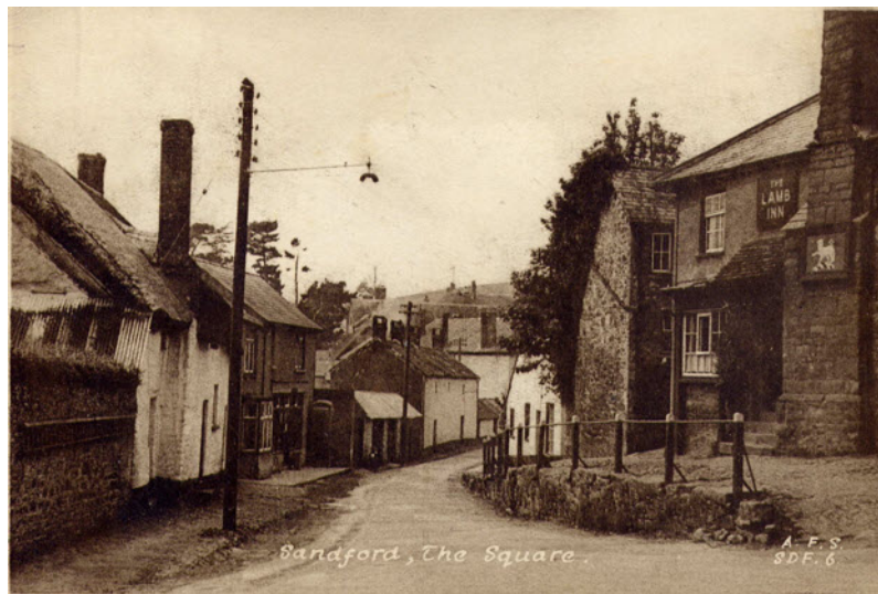
The Square, Sandford Village