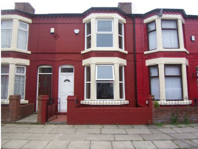
Canon Road, Liverpool today